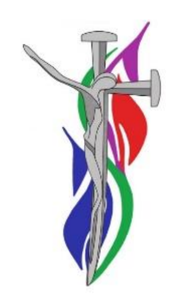
Achieving together in faith